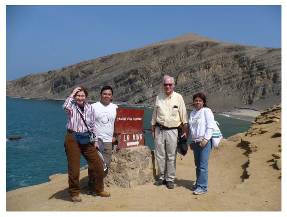
Field research group with section "La Mina" on the background.