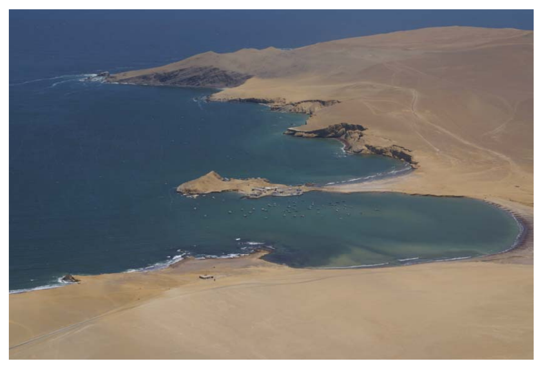
Paracas Peninsula, south: general sight to the access at the Carboniferous outcrop.